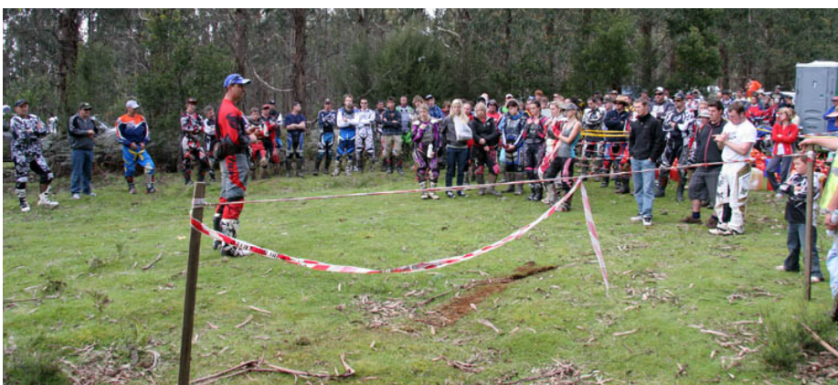
(Left) Riders briefing at the 8 Hour

This Sunday, November 22 at the Ulverstone Sound Shell (near the waterslide) starting at 10am. There will be lots of things to do and heaps of giveaways. BBQ lunch provided.