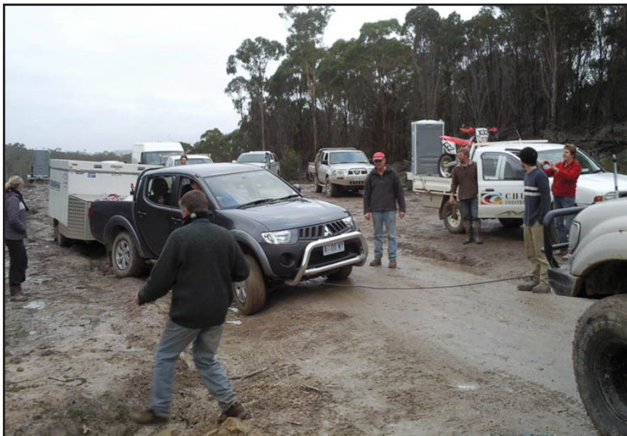
Eggs stuck in the "girl's 4WD" when trying to leave Bridport

For those of you who race motocross, the transponders that TERC use WILL WORK with the AMB timing system that MA Tas is introducing in 2010 as they are identical units. This means you only have to purchase ONE transponder, regardless what MA Tas says.