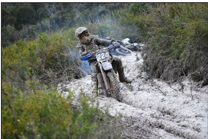
Race photos from Bridport