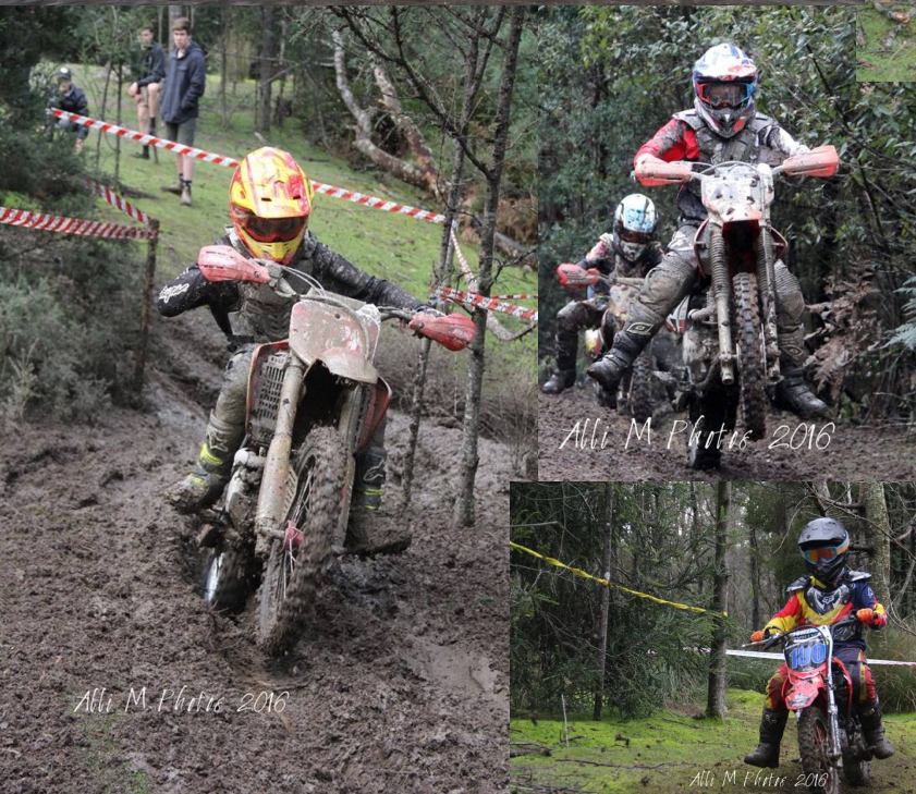
Alli M Photos 2016