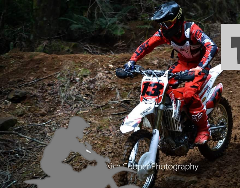
Jessica Cooper Photography