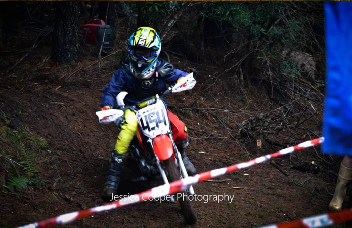
Jessica Cooper Photography