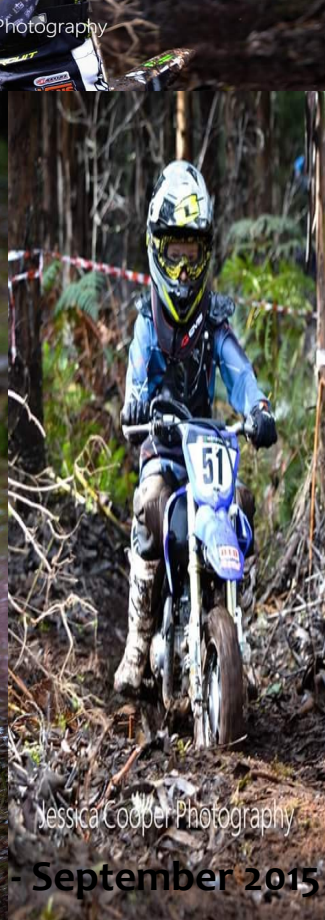
Jessica Cooper Photography